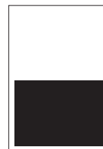
Half Page Horizontal Bleed Advertisement 152mm x 216mm