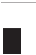
Quarter Page Vertical Bleed Advertisement 152mm x 112mm