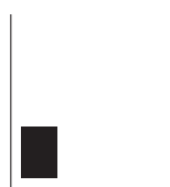
Directory Listing Advertisement 30mm x 50mm