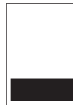
Quarter Page Horizontal Advertisement 60mm x 184mm