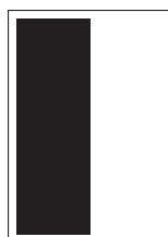
Half Page Vertical Advertisement 254mm x 90mm