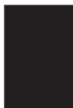
Full Page Inset Advertisement 251mm x 179mm